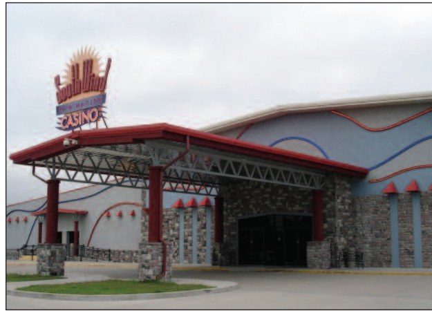
SouthWind Casino 5640 North LA Cann Road, Newkirk