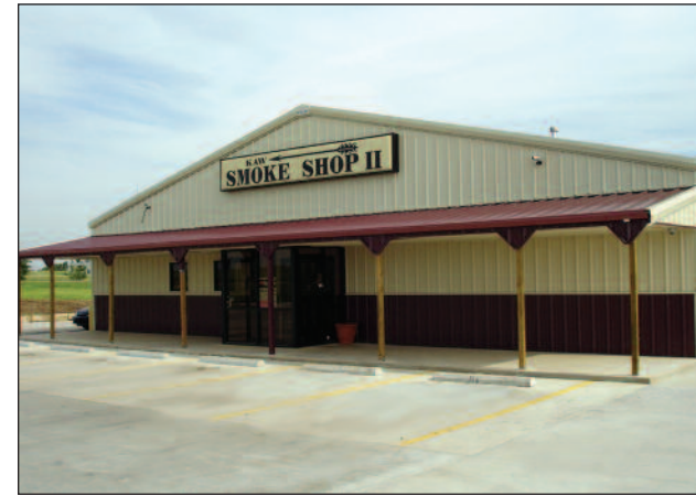
Smoke Shops I & II Inside SouthWind Casino at 5650 North LA Cann Road, Newkirk 1535 E Hubbard Road, Ponca City