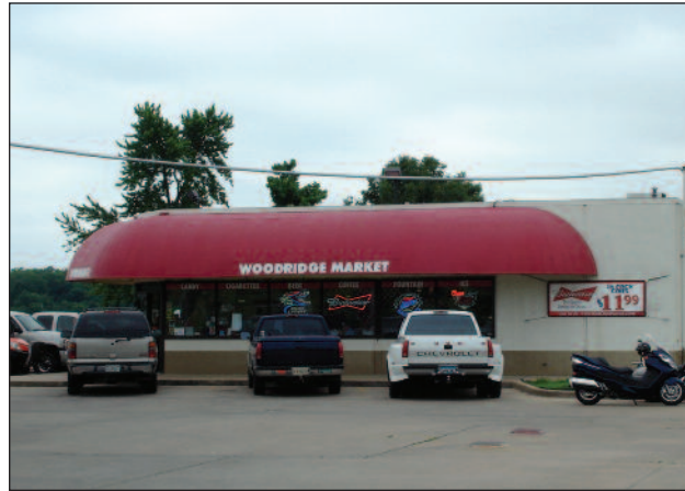
Woodridge Market 4128 Lake Road, Ponca City