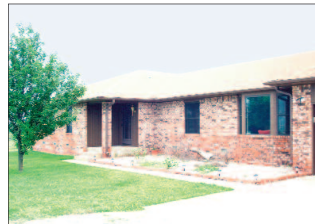
KEDA Executive Offices 4550 N. Highway 77, Ponca City