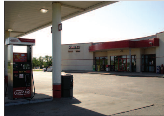
Kanza Travel Plaza I35 at Exit 231, Braman